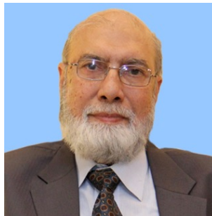
Sher Akbar Technical & vocational education